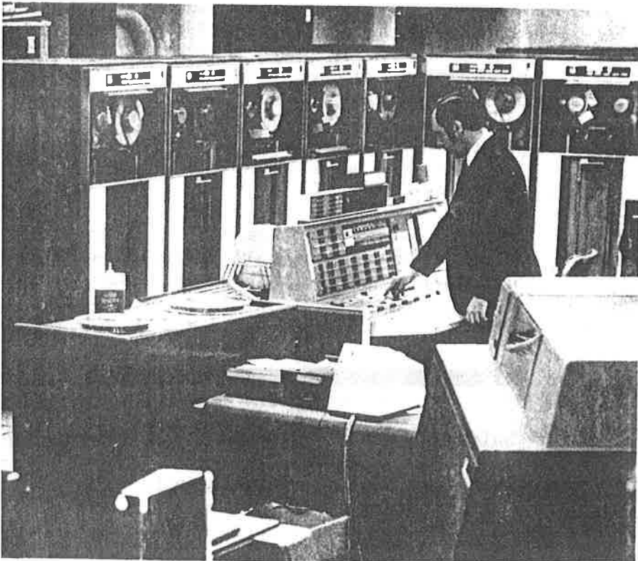
Timesharing at the Computer Center

According to the ALGOL 68 Report, a REFETY ROWSETY ROWWSETY NONROW slice may be rewritten as weak REFETY ROWS ROWWSETY NONROW primary, followed by a sub symbol, followed by ROWS leaving ROWSETY indexer, followed by a bus symbol.